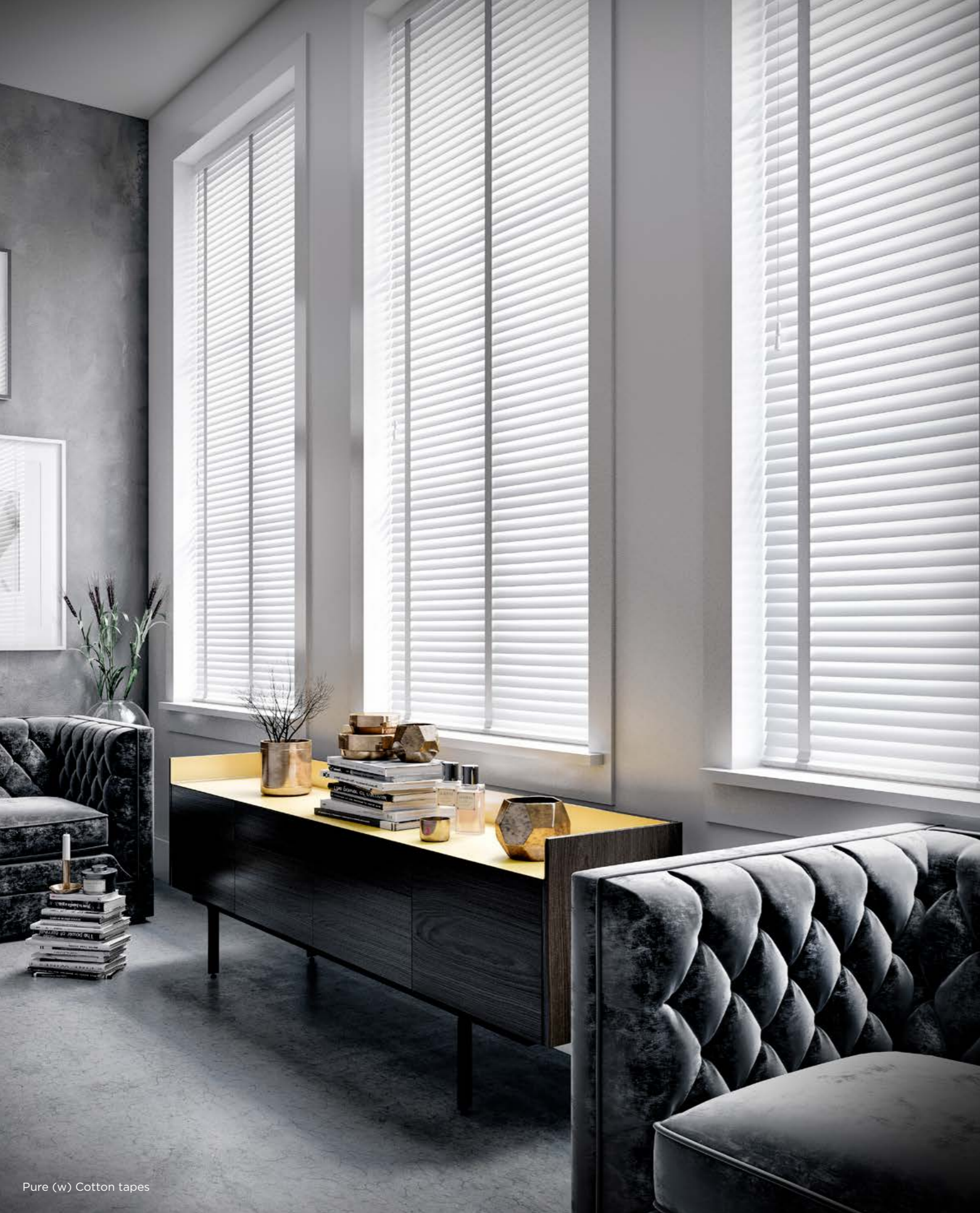
Pure (w) Cotton tapes