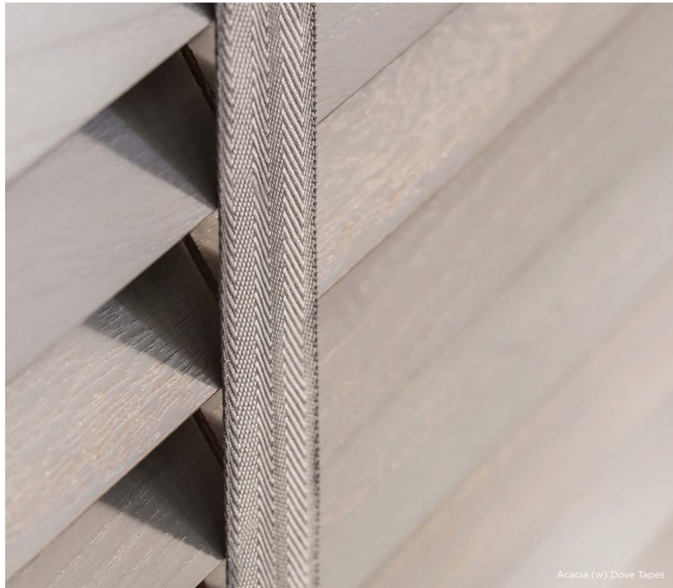
Acacia (w) Dove Tapes