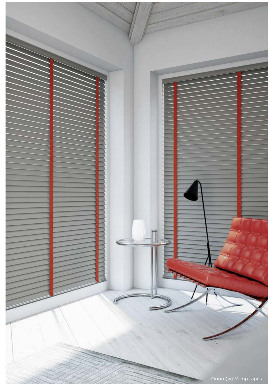
Orion (w) Vamp tapes

Emulating a sophisticated wood grain or a contemporary smooth finish, Faux Wood offers 35mm and 50mm slat widths. Crafted using high quality PVC, Faux Wood blinds are the perfect solution for areas of high moisture, such as kitchens and bathrooms.