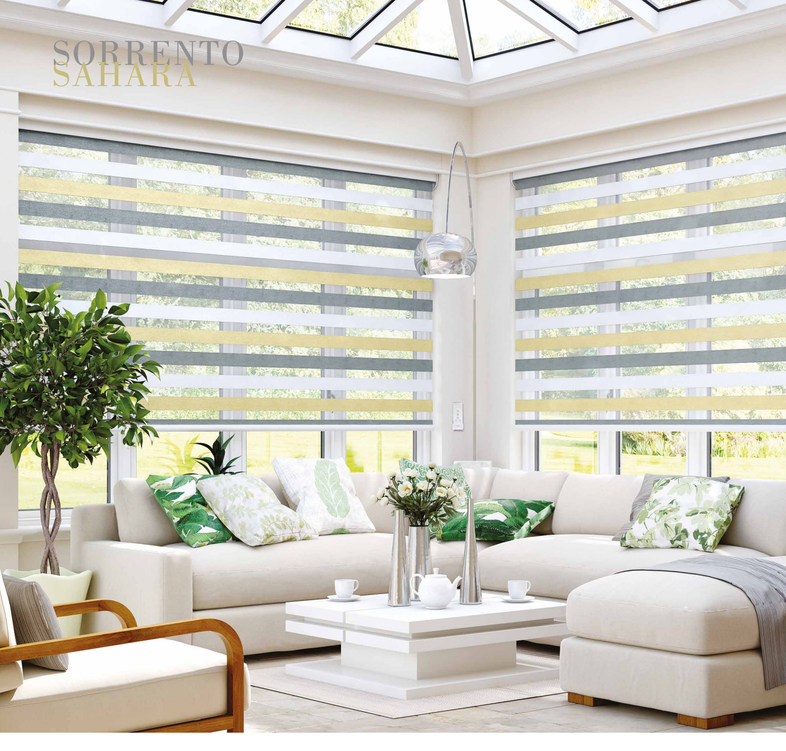
If you have been inspired, visit our website or contact your local Louvolite retailer...